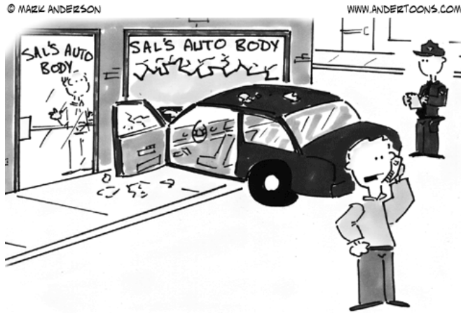
"Does our insurance cover irony?"