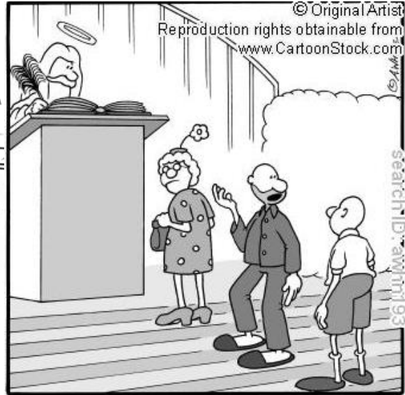
"I choked on a vitamin tablet."