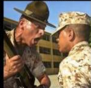
WHAT IT IS REALLY LIKE