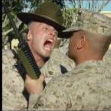
WHAT MY MOM THINKS IT'S LIKE