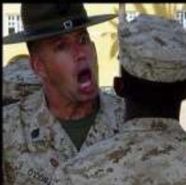
WHAT THE RECRUITER SAID IT WOULD BE LIKE