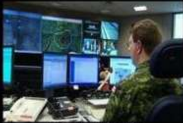
What my family thinks I do