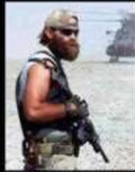
What strangers think I do