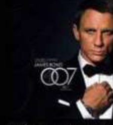
What my recruiter said I would do