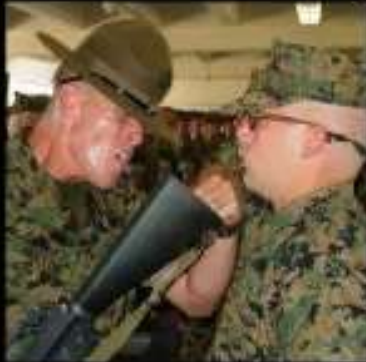
WHAT MY FRIENDS THINKS IT'S LIKE