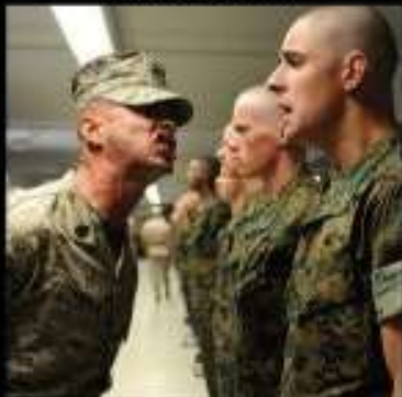
WHAT MY GIRLFRIEND THINKS IT'S LIKE