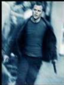
What Hollywood thinks I do