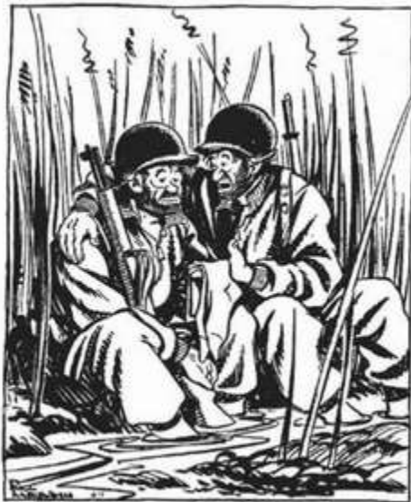
"Joe, yestiddy ya saved my life an' I swore I'd pay ya back. Here's my last pair of dry socks."