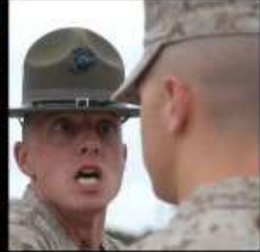
WHAT SOCIETY THINK'S ITS LIKE