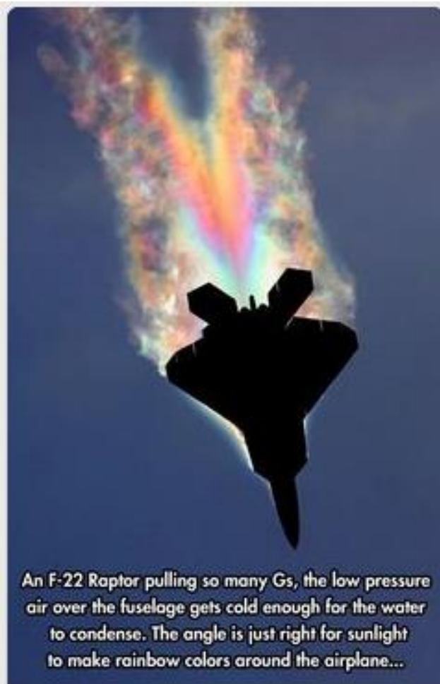
An F-22 Raptor pulling so many Gs, the low pressure air over the fuselage gets cold enough for the water to condense. The angle is just right for sunlight to make rainbow colors around the airplane...