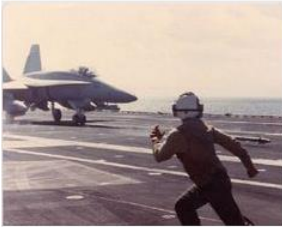
Aircraft Carrier Fail. The missile button works. Look close.