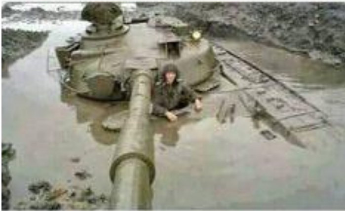
I think the engine is flooded