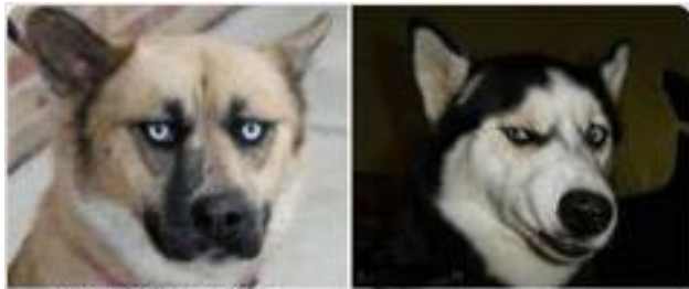
Command Sergeant Major