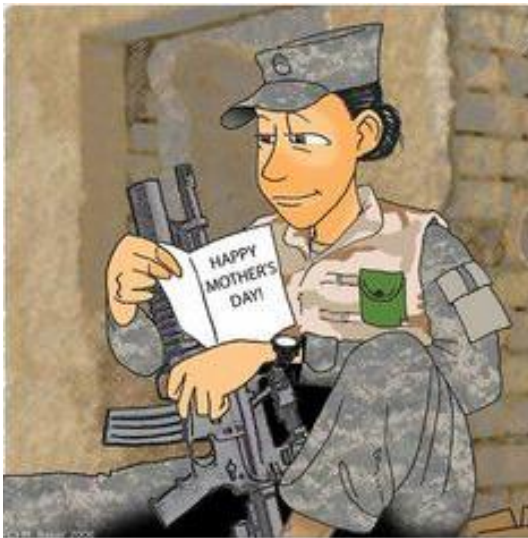
Not only is it just husbands, boyfriends, and fathers that fight.