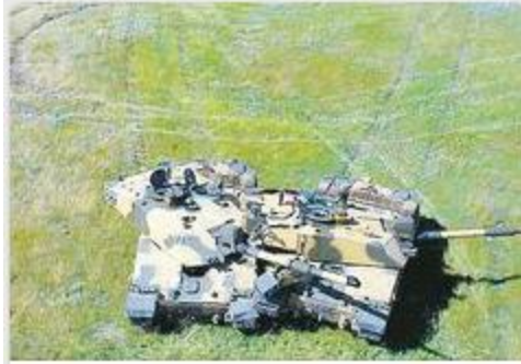
One of us has the wrong map.